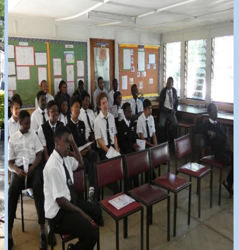
Year 9 Assembly Presentation