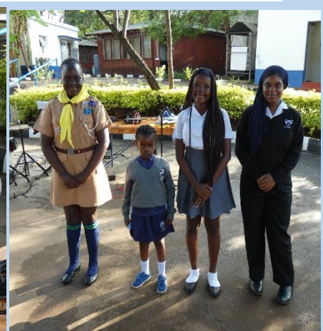
Highest House Points Achievers