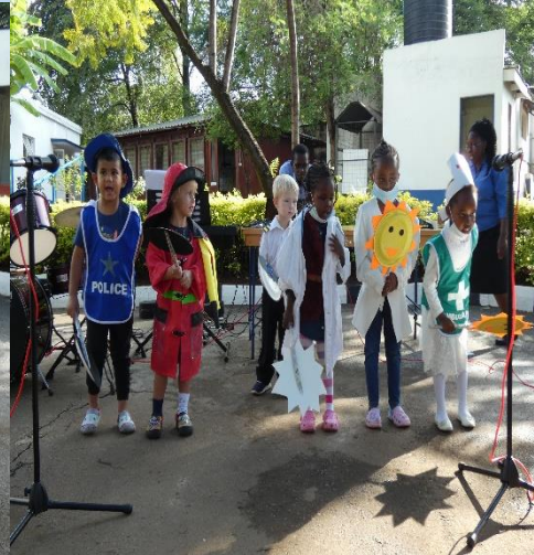
FS1 Assembly Presentation