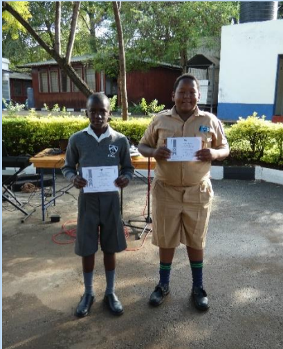
50 House Points Achievers