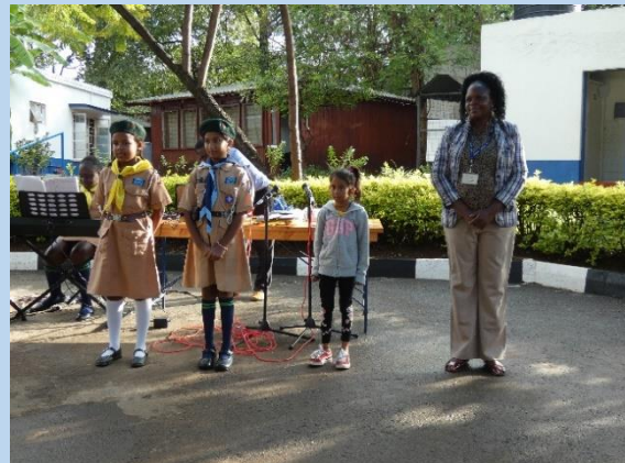
Happy Birthday wishes