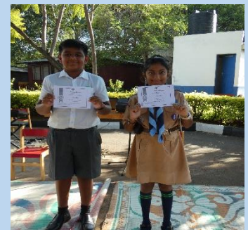
50 House Points Achievers