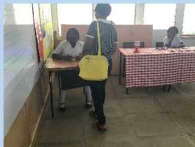
Year 5 Shopping Mall