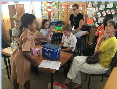
The year 4 scientists

Teaching and learning experiences have been great in BKIS this week as usual. The confident learners were able to truly show that they enjoy the BKIS learning experiences. This was evidenced in the Open Day activities as sampled below: