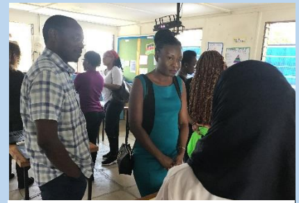
Market Mix: Business studies in action