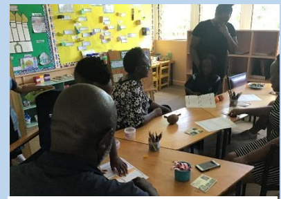
The artistic Year twos