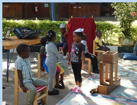
FS2 Assembly presentations