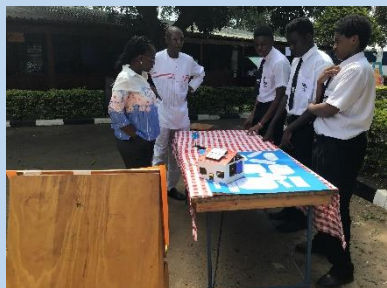
Environmentalists on solar energy