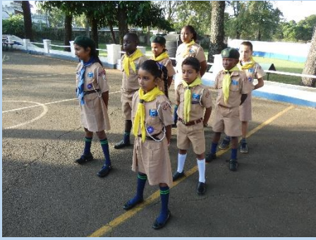
Scouts on duty