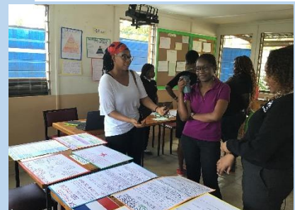
Historian explaining the German History