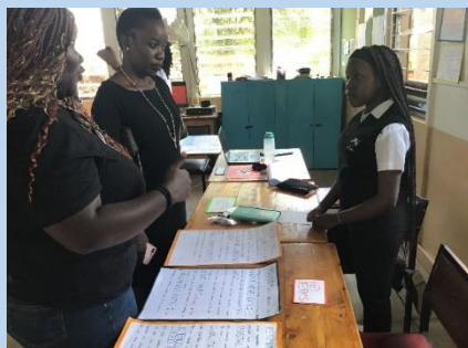
Sociologist: Explanation on Social inequalities