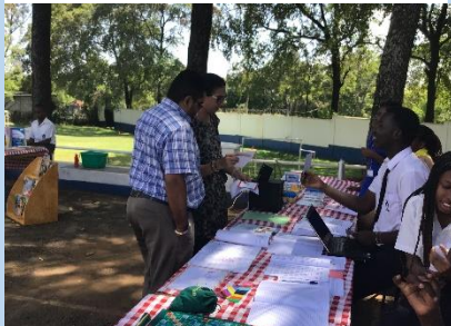
MFL students in action