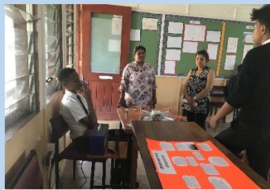
The senior inventors explaining how drones work