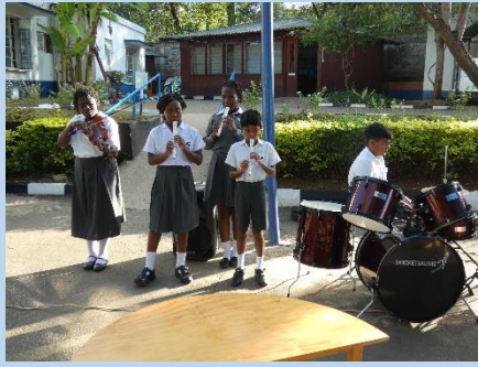
National Anthem Ensemble