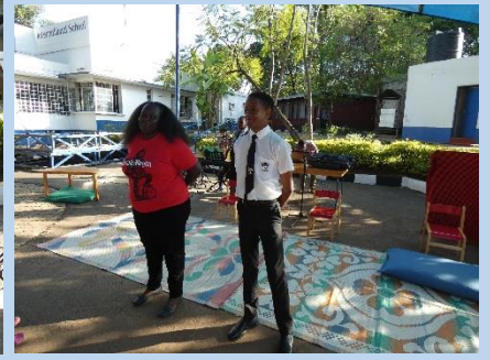
Happy birthday wishes