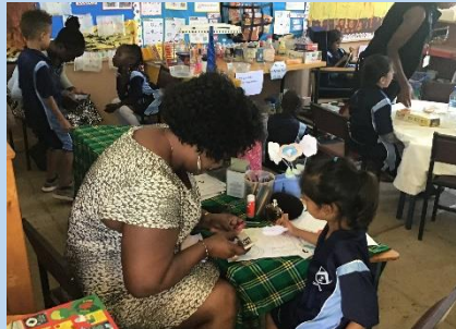
The Creative Year ones