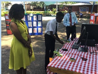
Lego Education in BKIS