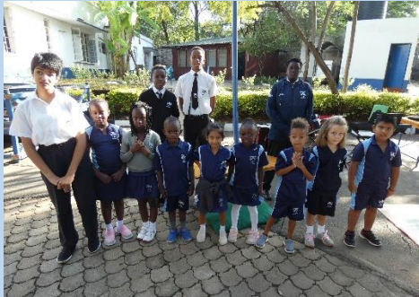
Highest House Points Achievers