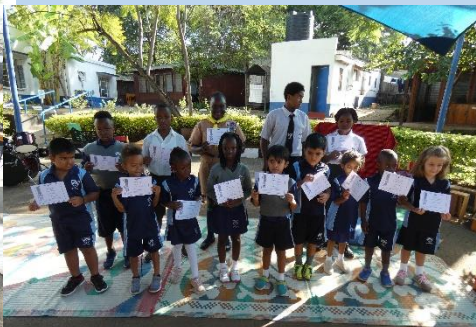
25 House Points Achievers