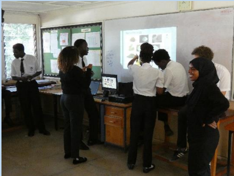
Year 10 Assembly presentation