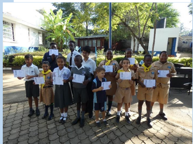
25 House Points Achievers