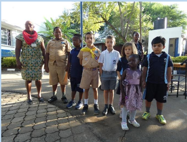
Happy Birthday wishes