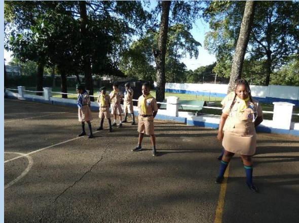
Scouts on duty