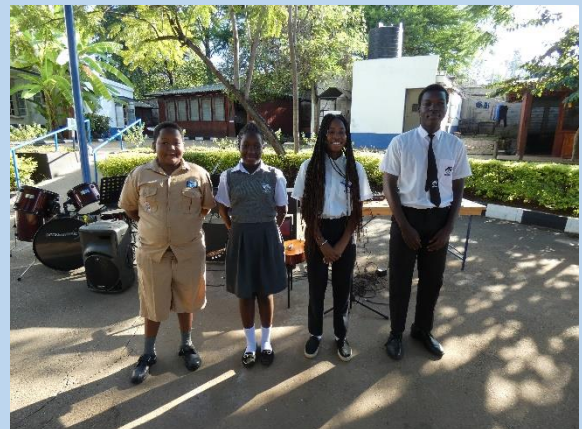
Highest House Points Achievers