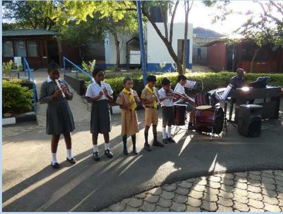
National Anthem Ensemble