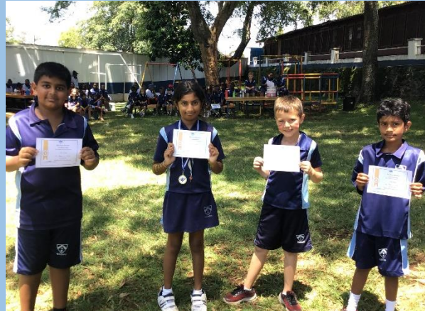
25 House Points Achievers