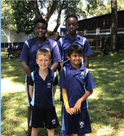
Highest House Points Achievers