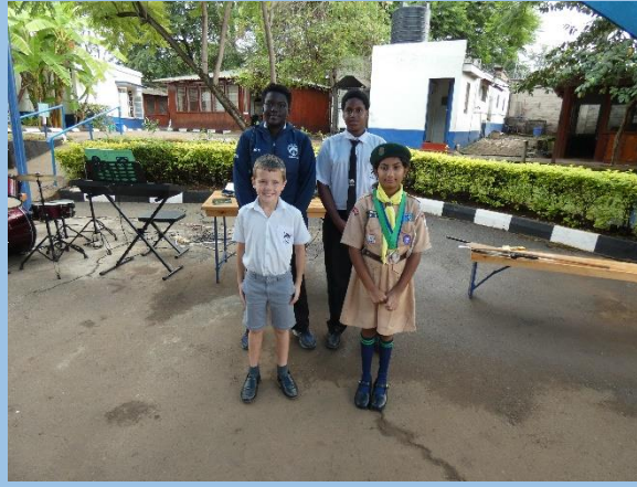
Highest House Points Achievers week 4