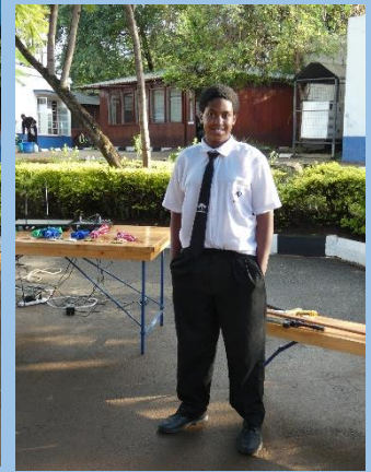
Happy birthday wishes 1