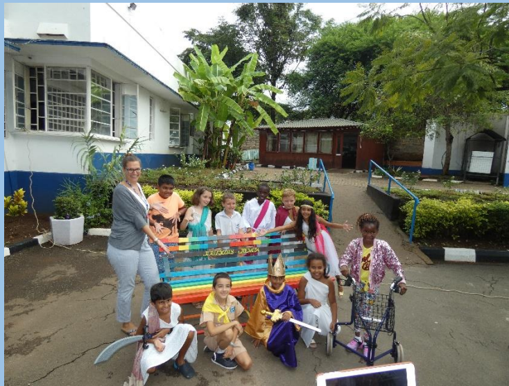
Friendship Bench as unveiled by the Year 4 students