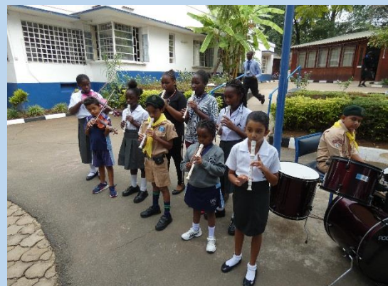
National Anthem Ensemble