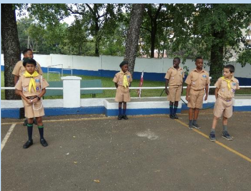
Scouts on duty