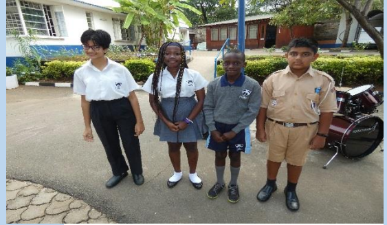
Highest House Points Achievers