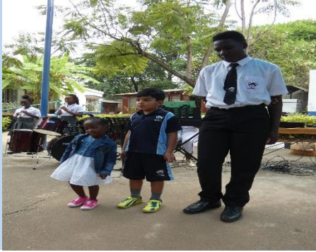
Happy birthday wishes