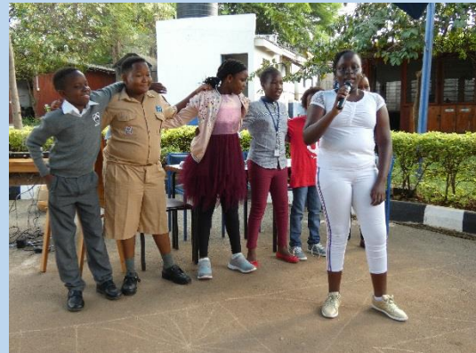
Year 6 assembly in action.