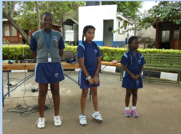
Participants in the Inter school verse speaking competition