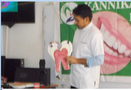
Dentist from Kannika Medical Centre

We also had the privilege of hosting some health professionals who enlightened the students on health matters.