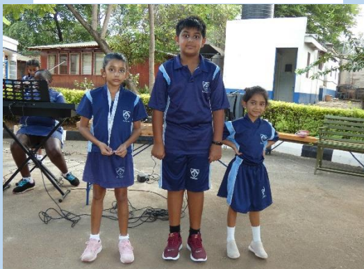
Happy birthday wishes