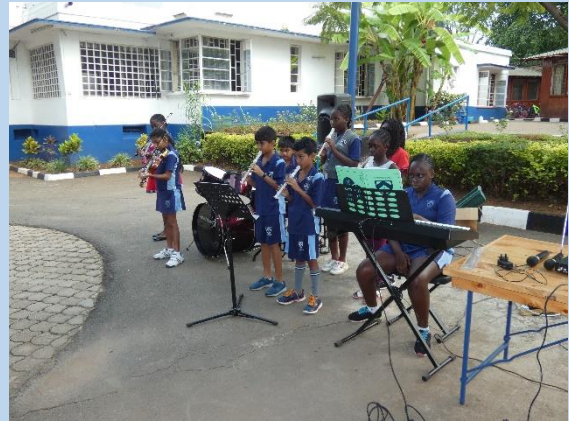
National Anthem Ensemble