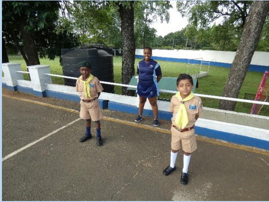
Scouts on duty