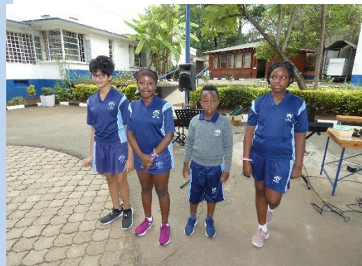
Highest House Points Achievers